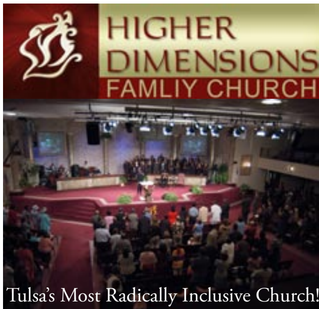
Tulsa's Most Radically Inclusive Church!

We want you to come celebrate God's Love with us.